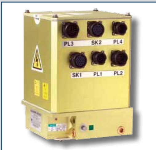
EP2002 Gateway Valve