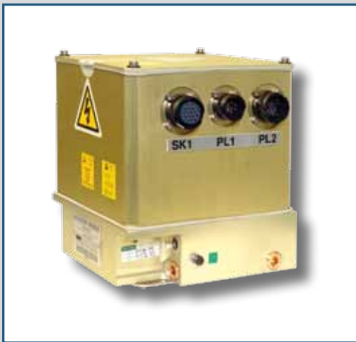
EP2002 Smart Valve