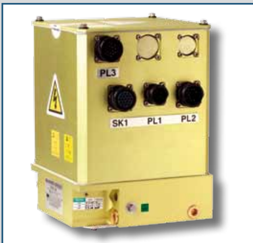
EP2002 RIO Valve